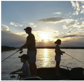
Sunset Boat Cruise

Depart from Askiesbos and take pleasure in a sunset boat cruise on the Okavango River. Get a drink from the bar to take along. Snacks included.